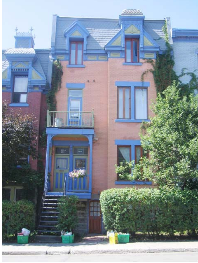
3) 3974-3978, Saint-Urbain