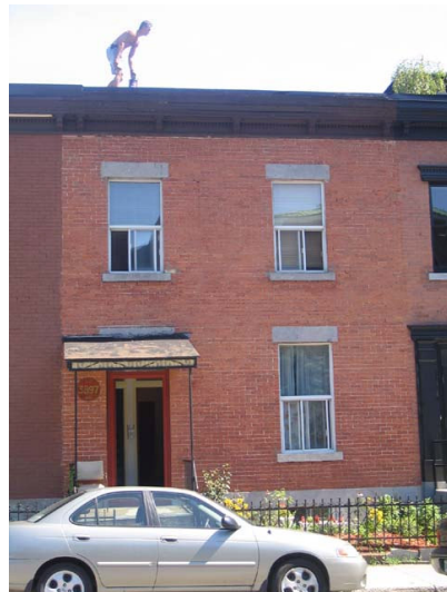
25) 3897, Saint-Urbain