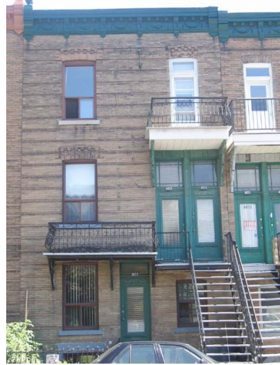
10) 3973-3977, Saint-Urbain