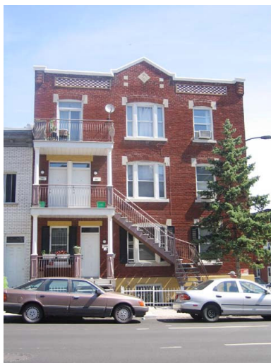
37) 3801-3805, Saint-Urbain