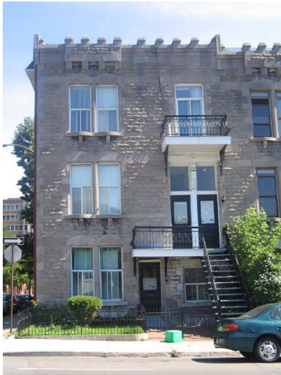
19) 3921-3925, Saint-Urbain