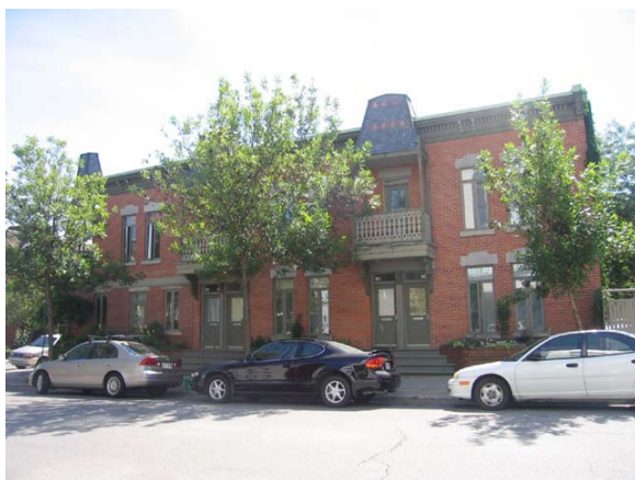
29) 72-82, Saint-Cuthbert