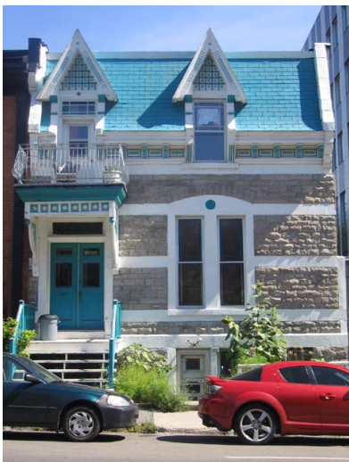
27) 3887-3889, Saint-Urbain